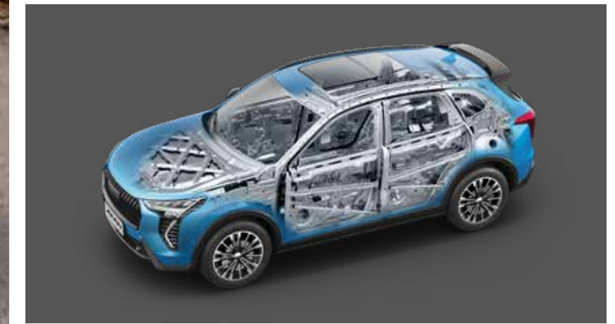
High Strength Steel Body