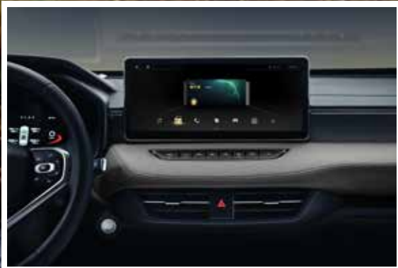
10.25-Inch Smart touch screen