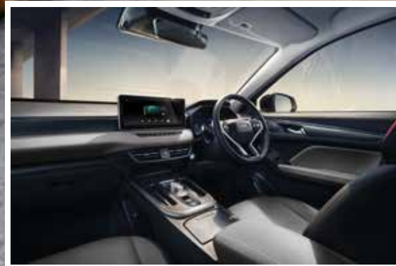
Smart phone Apple CarPlay® & Android Auto™