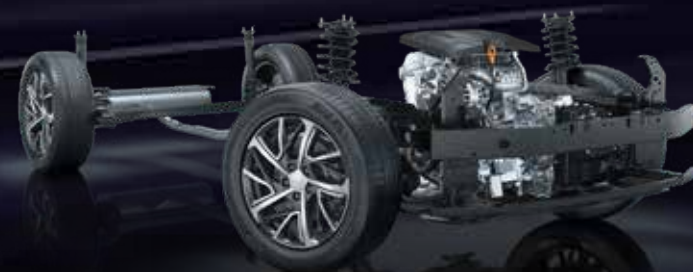
Chassis & Drivetrain Architecture