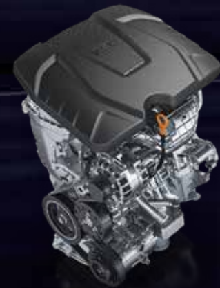
The 1.5T Engine, Maximum Rated Power 110kW, Max. Torque 220 N.m

An improved suspension setup in the all-new Haval Jolion offers a more responsive driving personl, featuring independent multi-link suspension. Paired with glossy 18-inch alloy sports wheels, every turn becomes a statement.