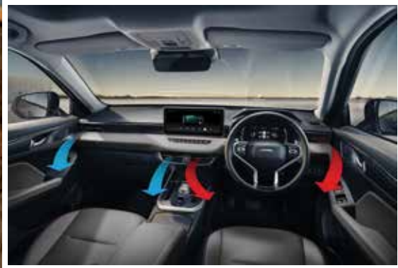
Dual-Zone climate control

The innovative Head Up Display is pure intelligence in motion – enabling cutting-edge safety, with guidance on critical information clearly projected on the windscreen.