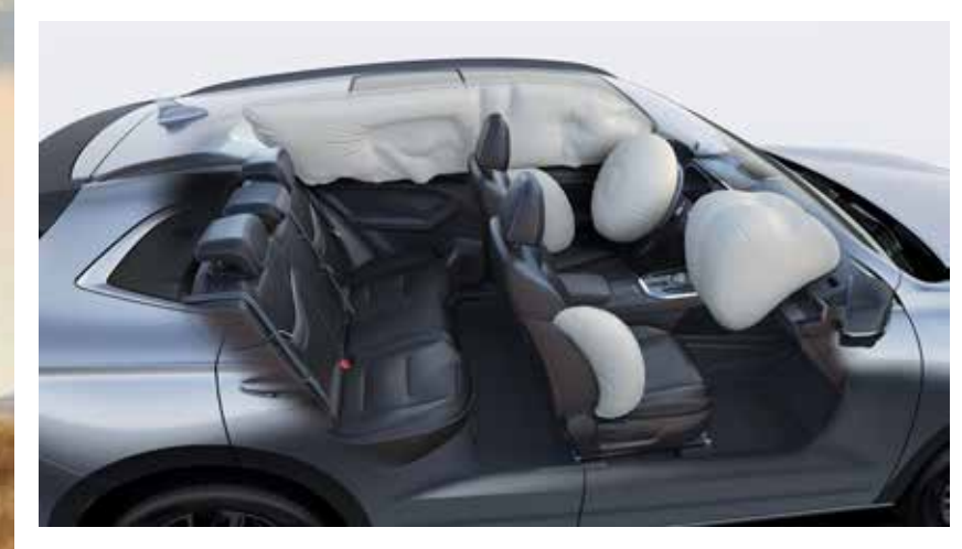
6 Omni-Directional Airbags